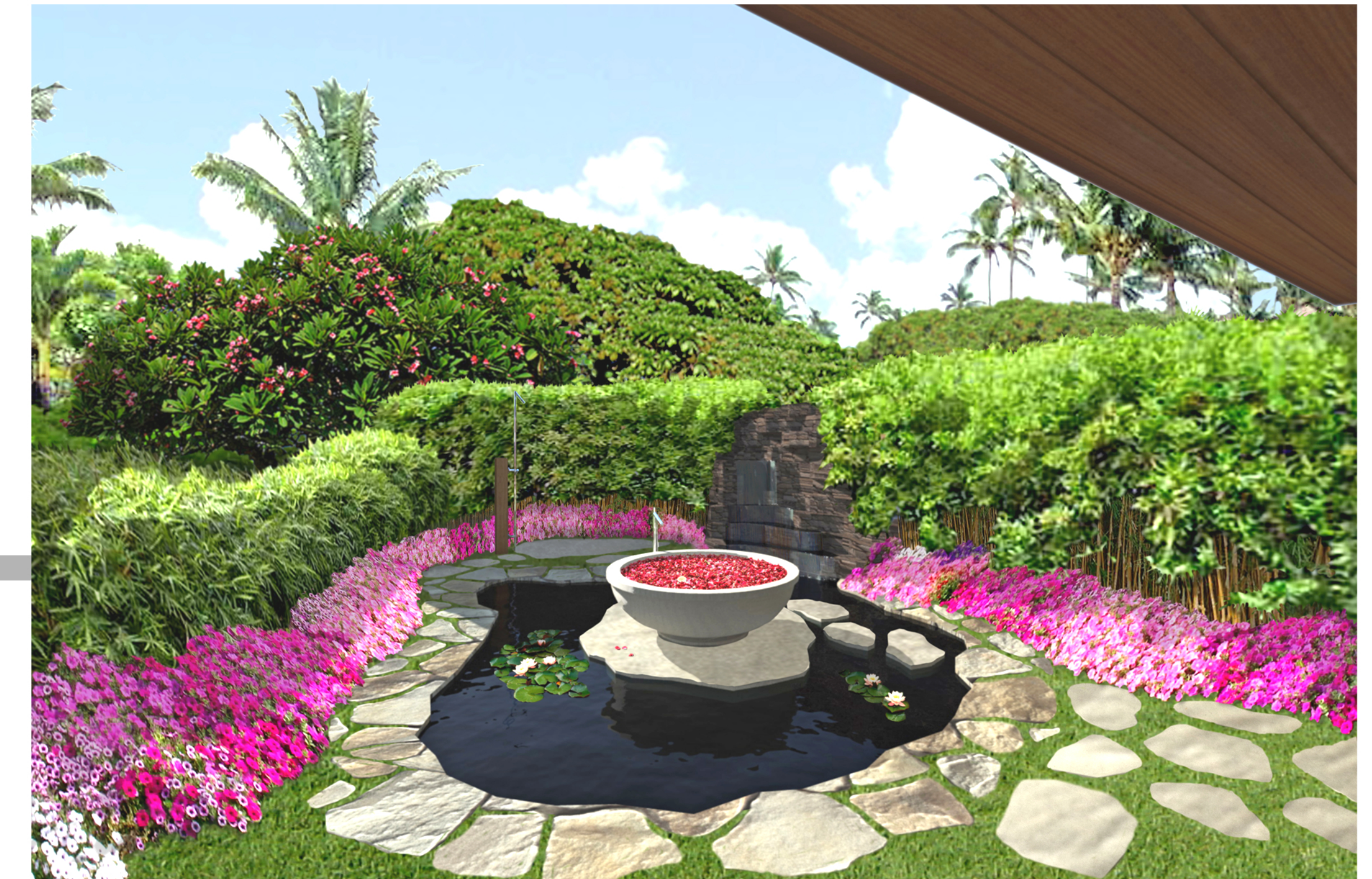
MASTER HALE GROTTTO